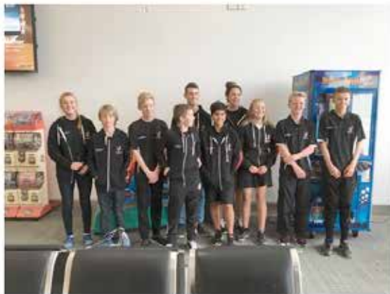
NZ Team ready to leave Auckland

The first few days were spent acclimatising to 36 degrees celcius, setting up boats, training in local conditions, measuring sails, registering for the regatta and cooling off in the pool. The Opening Ceremony was a very colourful affair with all 15 teams (Australia, Singapore, USA, Thailand, India,